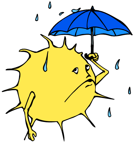
Maybe not: Low Vitamin B-12 or folate levels can make you feel like you're depressed.